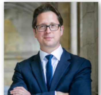
Alex Burghart Parliamentary Under Secretary of State (Minister for Skills)